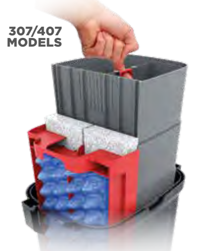
Media baskets are subdivided for more customizable options.