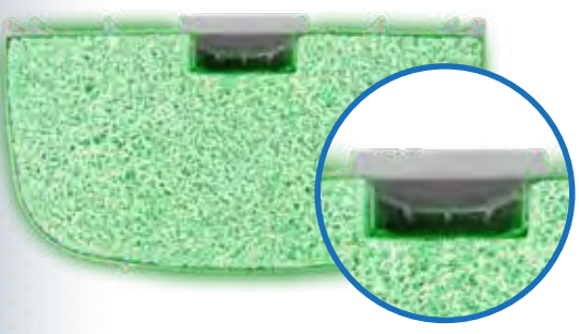
CUSTOM FIT NO GAPS MEANS

Designed specifically for the Fluval 07 and canister filters, these pads are composed of a complex interwoven infused resin with embedded phosphate, nitrite or ammonia removers, which effectively trap floating waste and debris for a clean and clear aquarium.